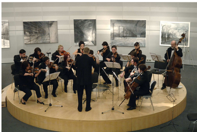
Concert in European Parliament Brussels, September 2006

The Caucasian Chamber Orchestra was founded in summer 2005, including outstanding string players of the Caucasian region under the leadership of the German conductor, composer and pianist Uwe Berkemer.